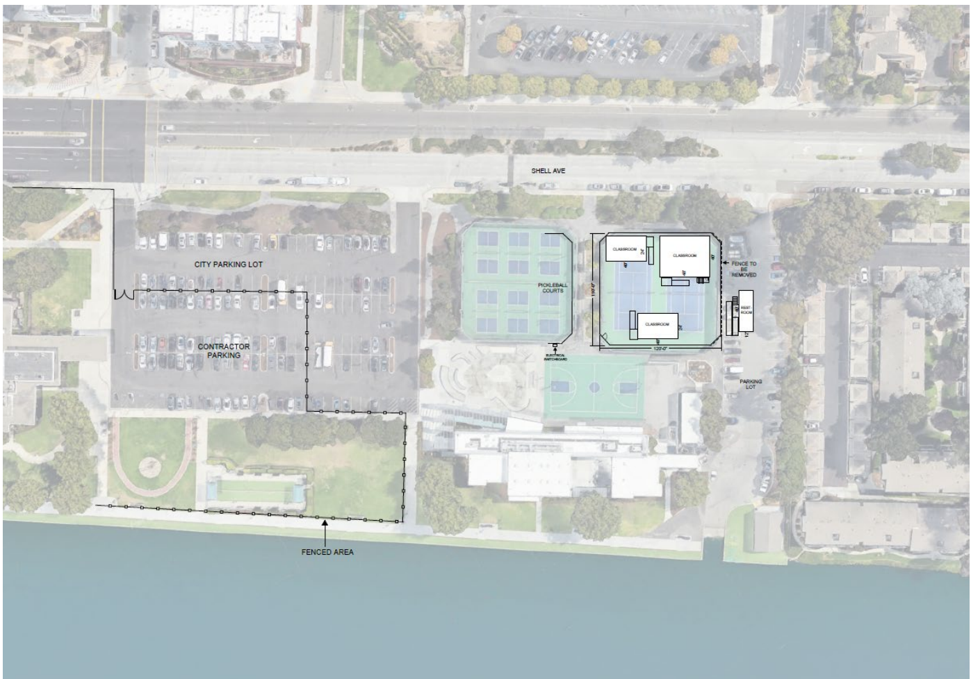
Appendix A- 1

EXCLUSIONS: Pricing shall not include any clearing or grading of the site, obstruction removal or any asphalt transitions. no furniture, casework, appliances, doorstops, data or phone lines shall be included in the proposal.