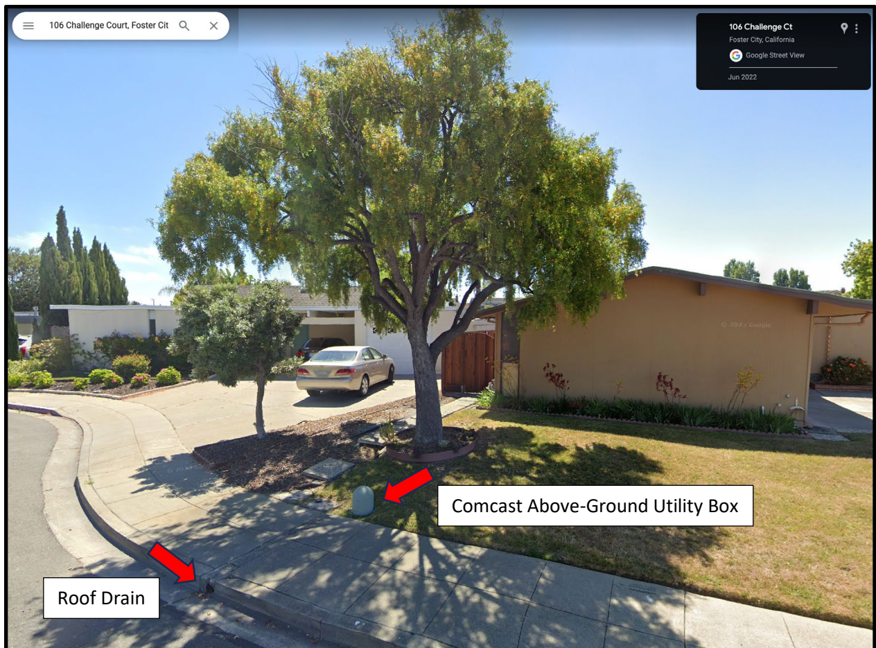
Figure 2 Google Streetview Image – 106 Challenge Ct Proposed Driveway Location

The existing tree on 106 Challenge Ct appears to be impacted and would likely result in tree remove due to impacts to the root system of the tree along with driveway proximity.