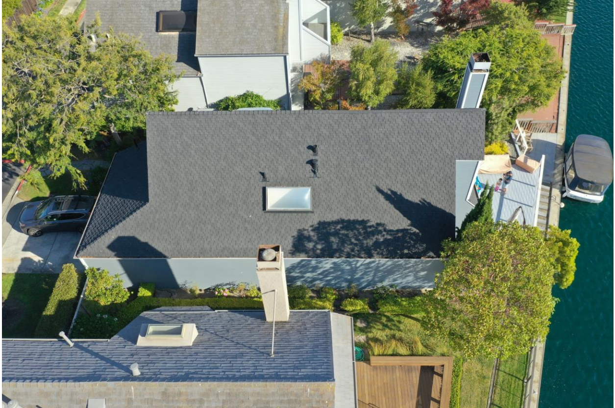
Figure 3 Existing North Elevation taken from an aerial angle due to reduced setback of neighboring home (610 Bridgeport Ln in foreground, 614 Plymouth Ln in background)