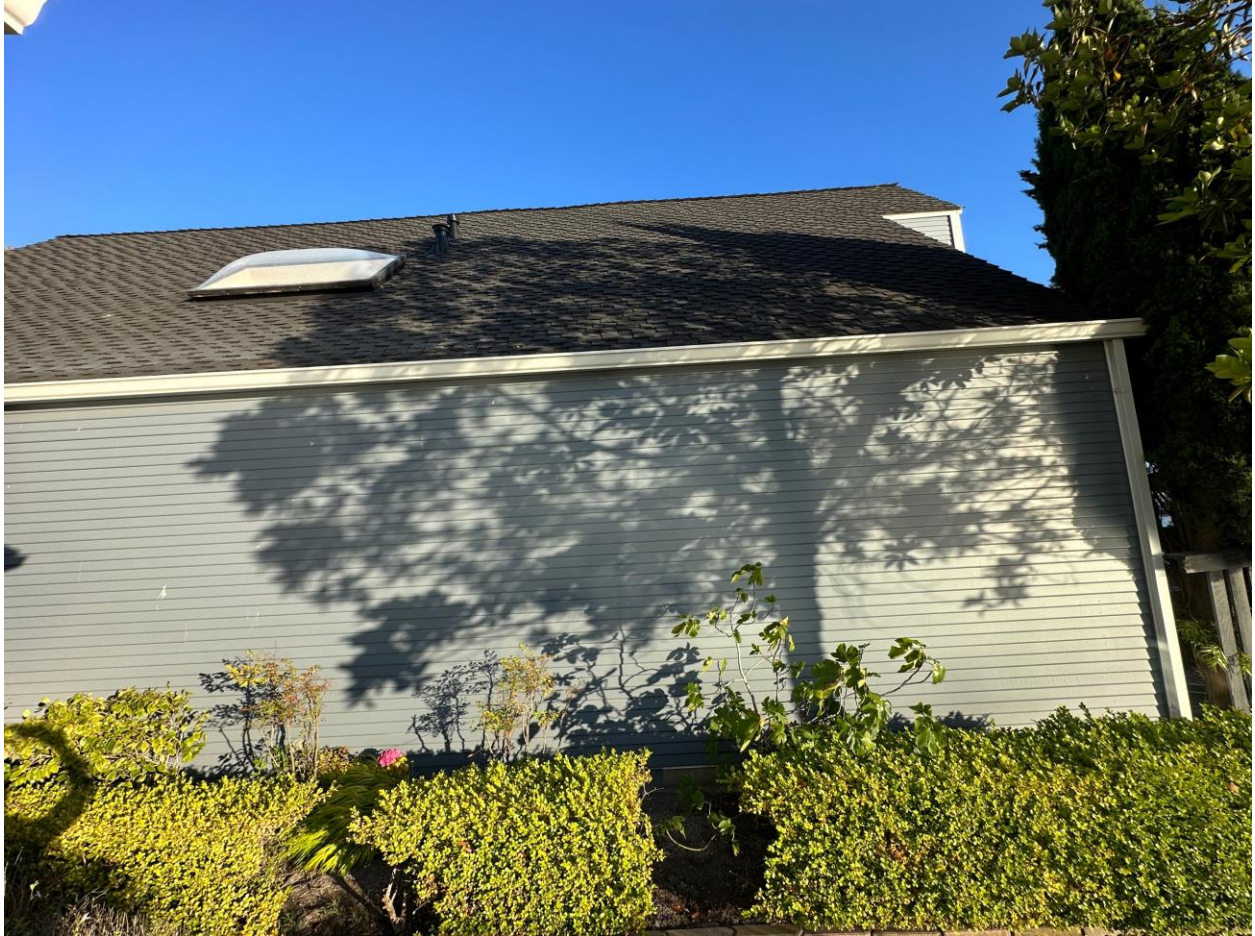
Figure 6 Existing North-facing Elevation showing rear-section of the house