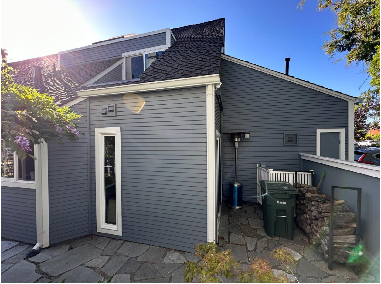
Figure 8 Existing South-facing elevation, front portion of home with garage and nook area in view