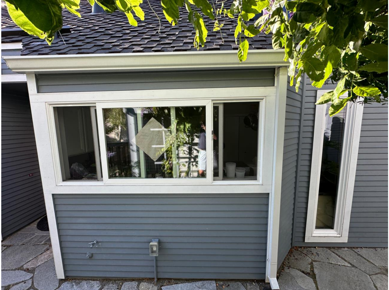
Figure 9 Existing South-facing elevation with front door and kitchen area in view