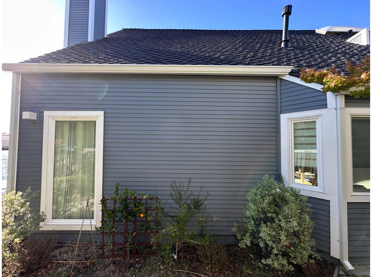
Figure 10 Existing South-facing elevation with rear of the home in view