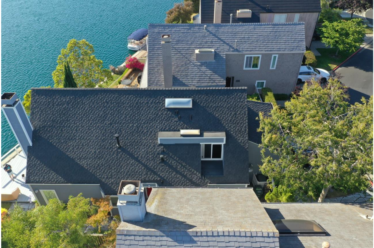
Figure 7 Existing South Elevation taken from an aerial angle due to reduced proximity of neighbor's home (614 Plymouth Lane in foreground, 610 Bridgeport Ln in background)