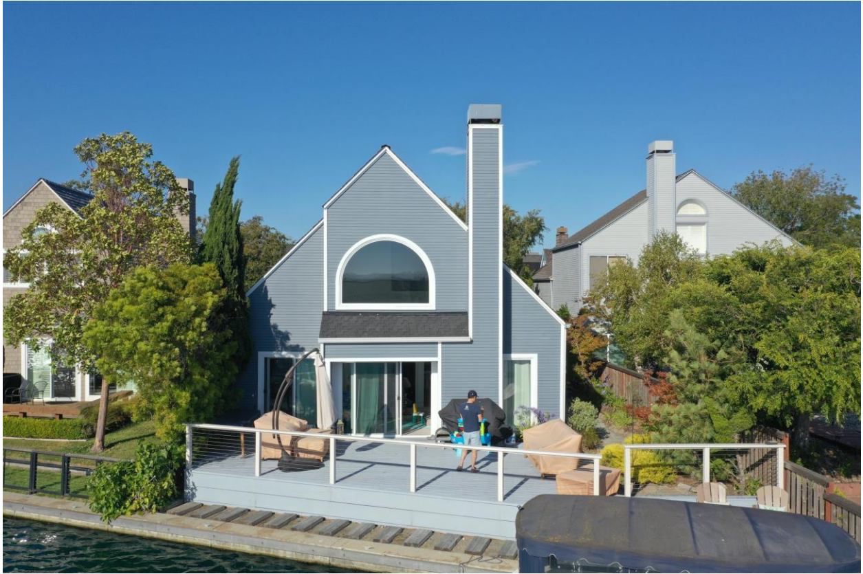
Figure 2 Existing Rear Elevation