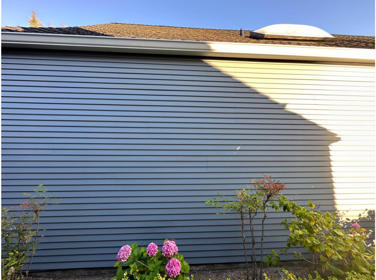
Figure 5 Existing North-facing elevation showing mid section of the house