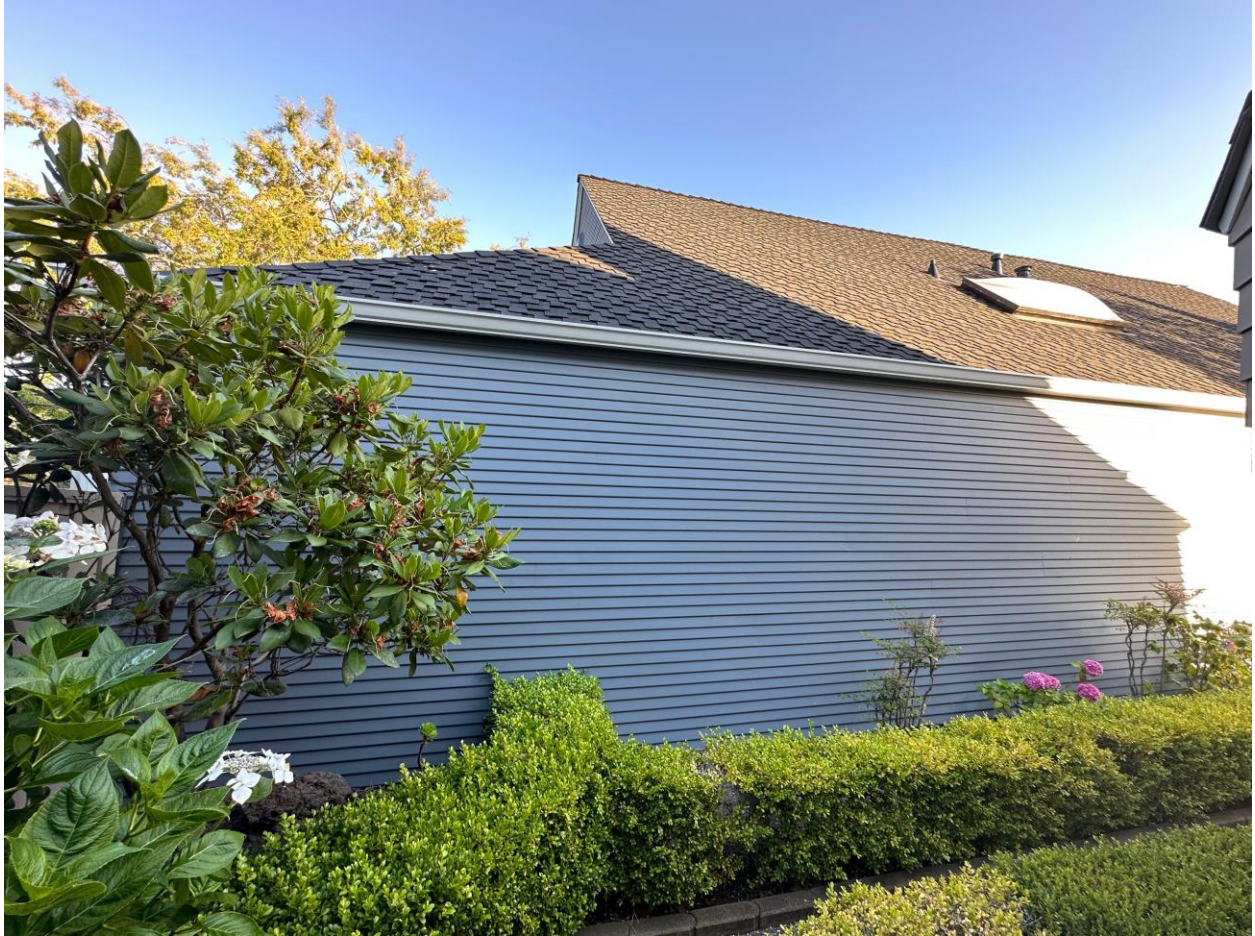
Figure 4 Existing North-facing elevation showing front portion of house